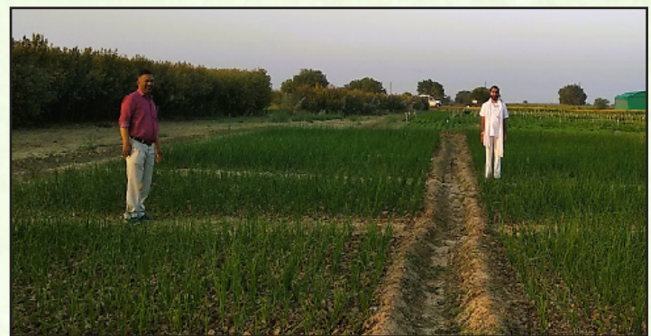
Crop stand of linseed, Gram & Wheat at Crop Research Station