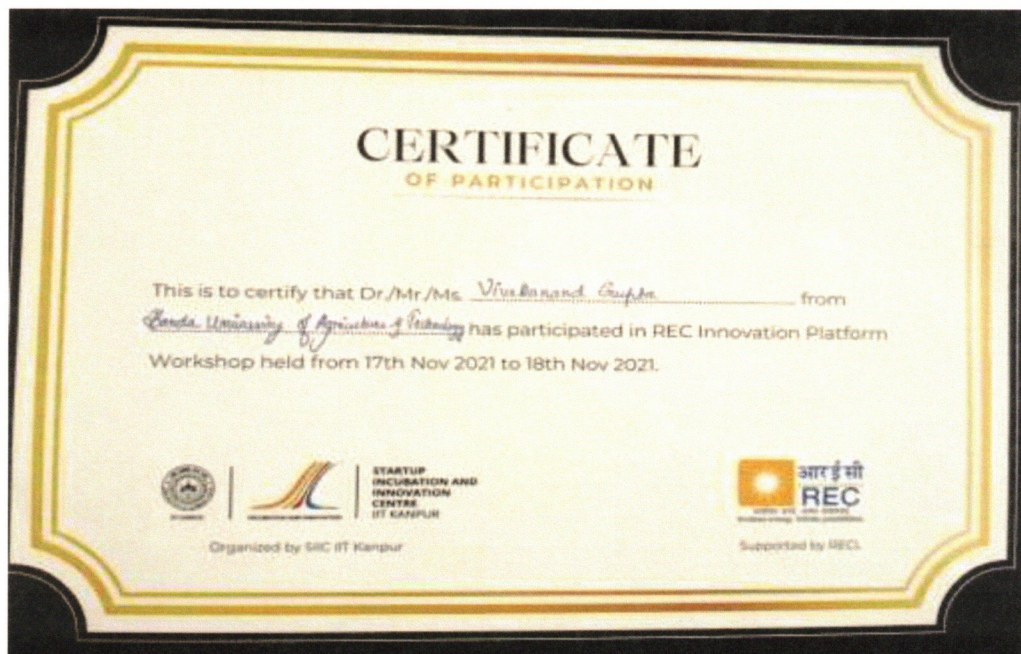
Certificate of Participation in REC innovation platform

Collaboration with SIIC IIT Kanpur: The Counselling and Placement cell of the university and SIIC IIT Kanpur did collaboration. SIIC IIT Kanpur has developed the REC Innovation Platform as its initiative towards developing and motivating young minds in colleges and universities across the state of Uttar Pradesh. The program is supported by the Rural Electrification Corporation Limited (RECL), a public sector undertaking in India. In this program, students will undergo a process of research conceptualization and will be encouraged to be creative, critically think, collaborate, and communicate their research findings on a topic ranging from science and commerce to law and humanities. Altogether 26 students of BUAT have been selected through a test and they are associated in different fields like Agritech, Biotech, Solar Energy, etc