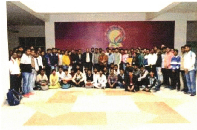
Group Photo session with resource person & participants