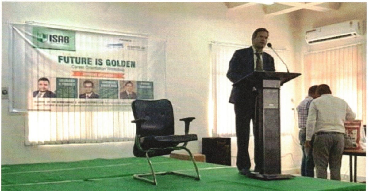
The expert from the organization interacted with the students