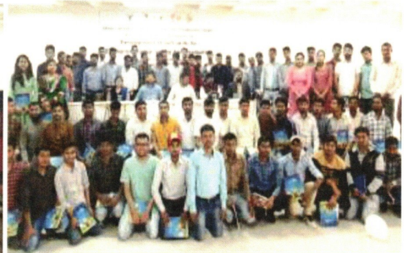
Group Photo session with resource person & participants