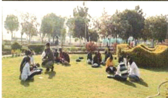
Boot Camp Programme of different activities