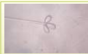
Conidia and conidiophore of Arthrobotrys oligospora