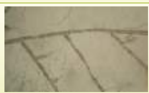
Hyphal parasitism of Rhizoctonia solani by A. oligospora